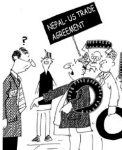
If no agreement we'll burn these tires right in the middle of Manhattan.